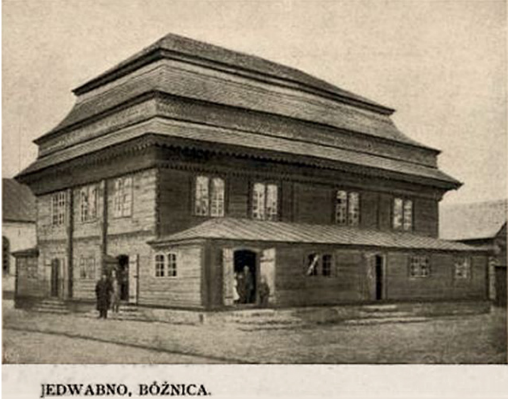
Jedwabne synagogue in Poland before 1913.

The law created a major diplomatic crisis between Poland and Israel. The U.S. criticized the Polish law as well. The dispute was resolved when the Polish government, with input from Israel, amended the law essentially decriminalizing, and softening it. Still, Netanyahu was criticized for his joint statement with his Polish counterpart, which alluded to the involvement of the Polish resistance in helping Jews. Israeli historians, including the Yad Vashem Holocaust Memorial and Museum in Jerusalem, considered that a distortion of history.