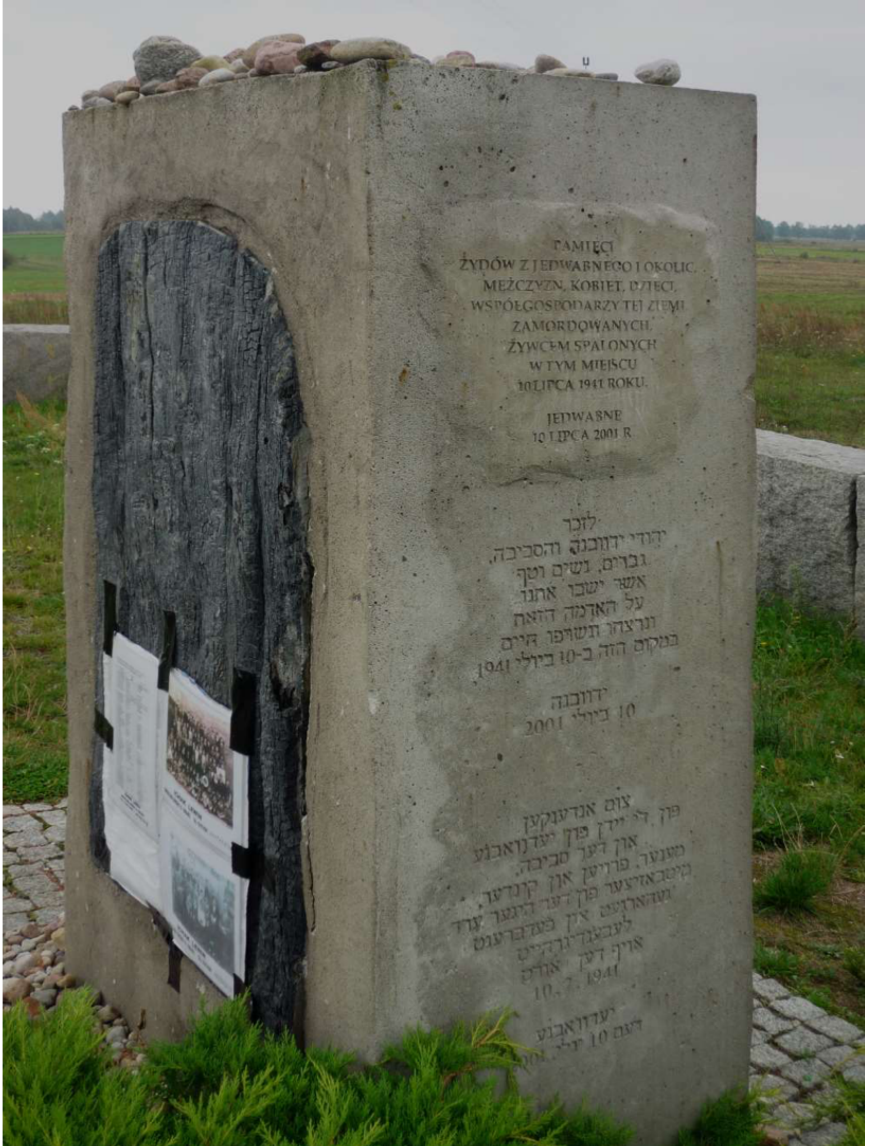
(Front Page Mag)