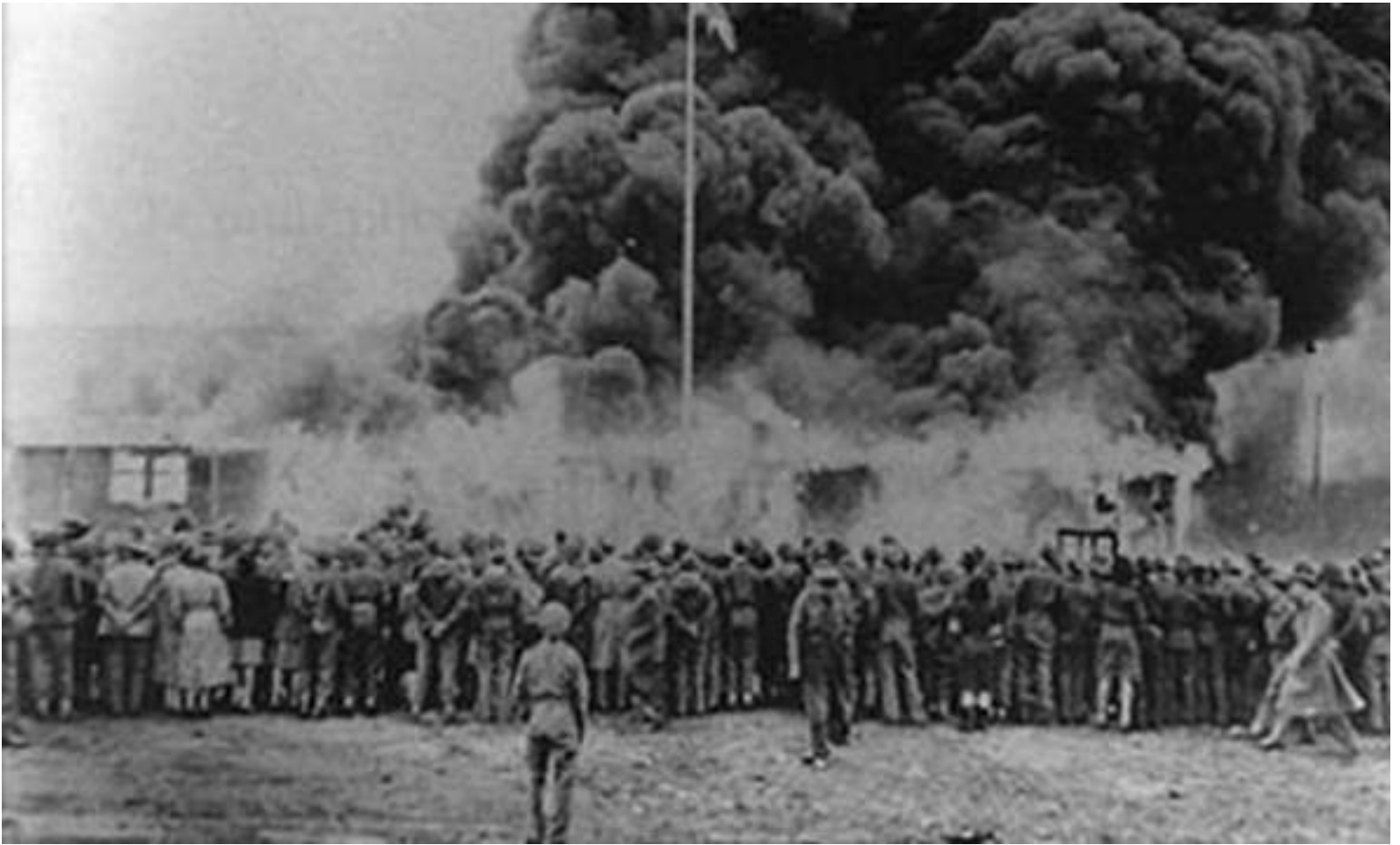
Poles watching barn burning in Jedwabne, Poland on July 10, 1941 into which they'd herded hundreds of their Jewish neighbors.

Polish anti-Semitism has been endemic in the past, with some strains of it still contaminating Polish society.